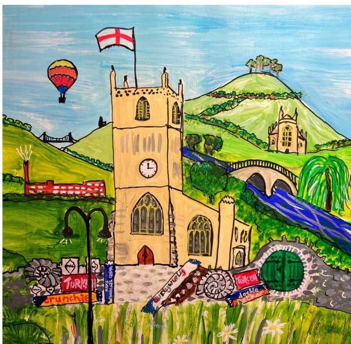
An Artist's View of Keynsham